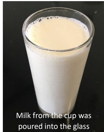
Milk from the cup was poured into the glass

Which container looks like it should hold more? Does it actually really hold more? What is surprising?